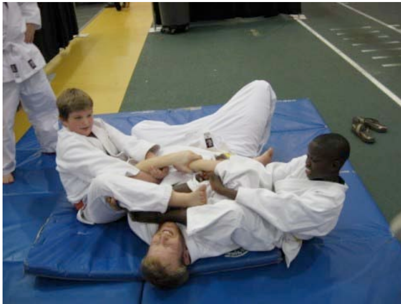
Judo at Springdale's Jones Center.