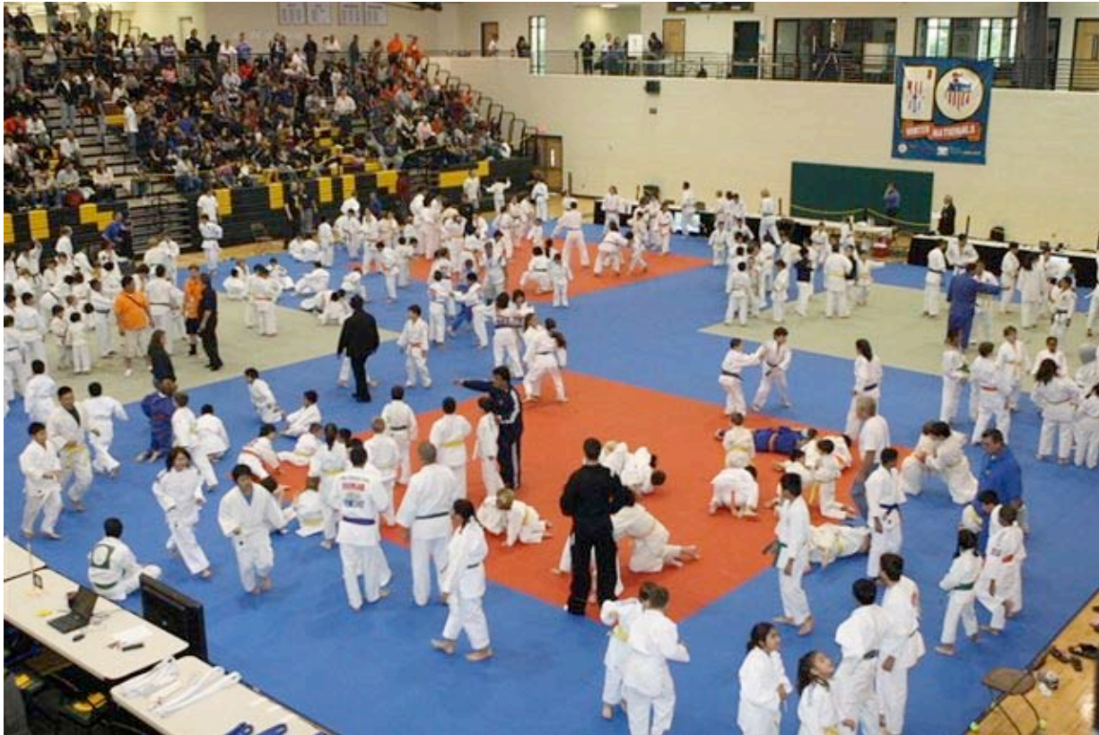
Above: USJA/USJF Winter Nationals