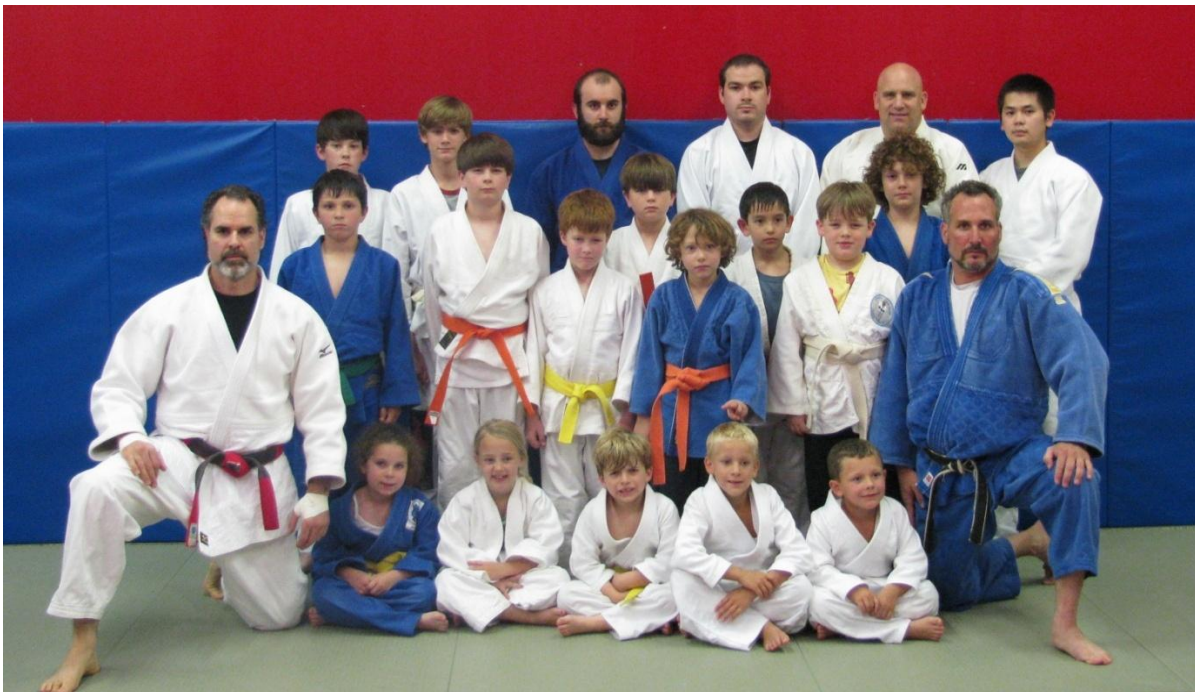
GCJ Judoka who traveled to Waka Ma Shu 2012 (3 Gold, 1 Silver, 1 Bronze)