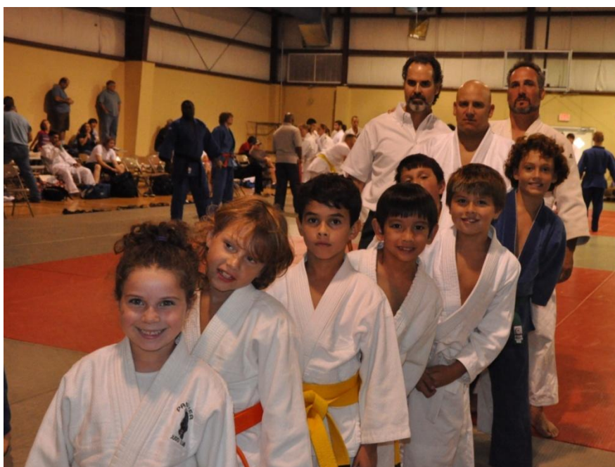
Gulf Coast Judo team lining up--see feature on pages 19-20