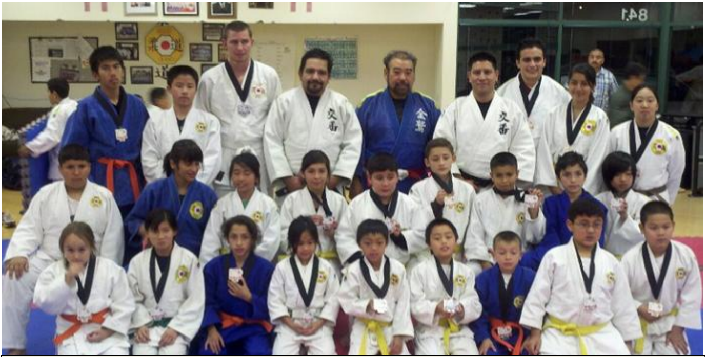
Most recently, the club won 6 Gold, 12 Silver, and 4 Bronze medals at the 2011 USJA/USJF Winter Nationals!