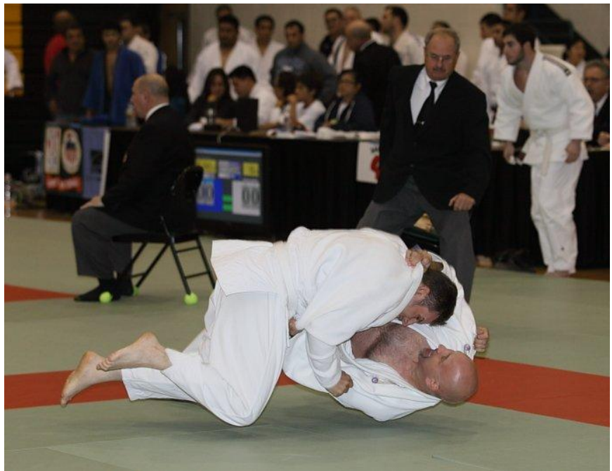
Photos from the 2011 USJA/USJF Winter Nationals