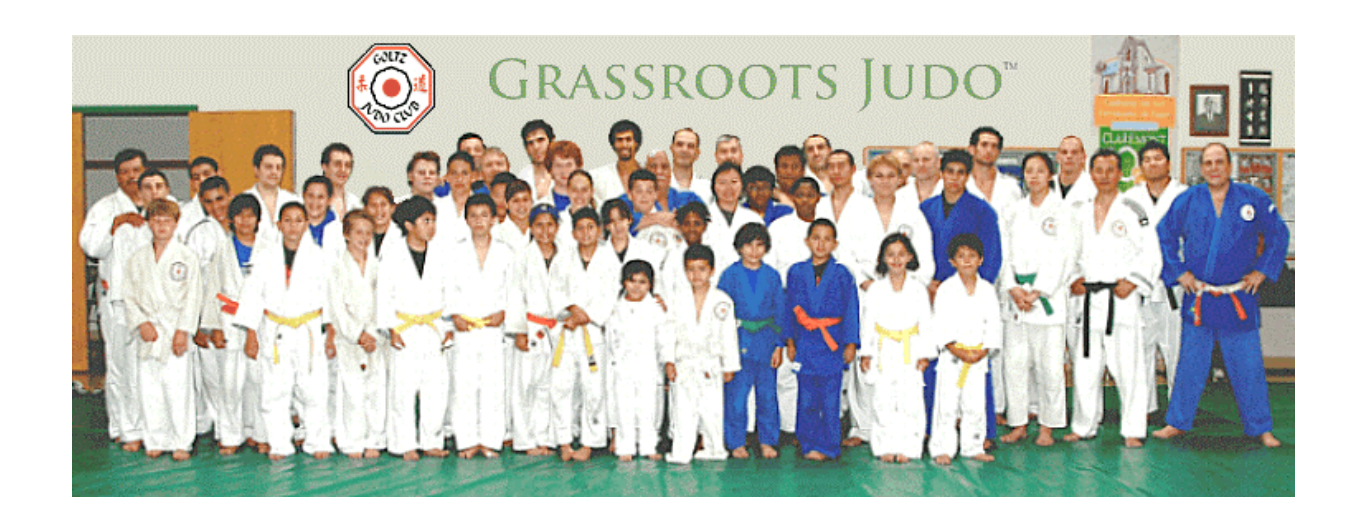
Current Dojo Alexander Hughes Community Center 2009