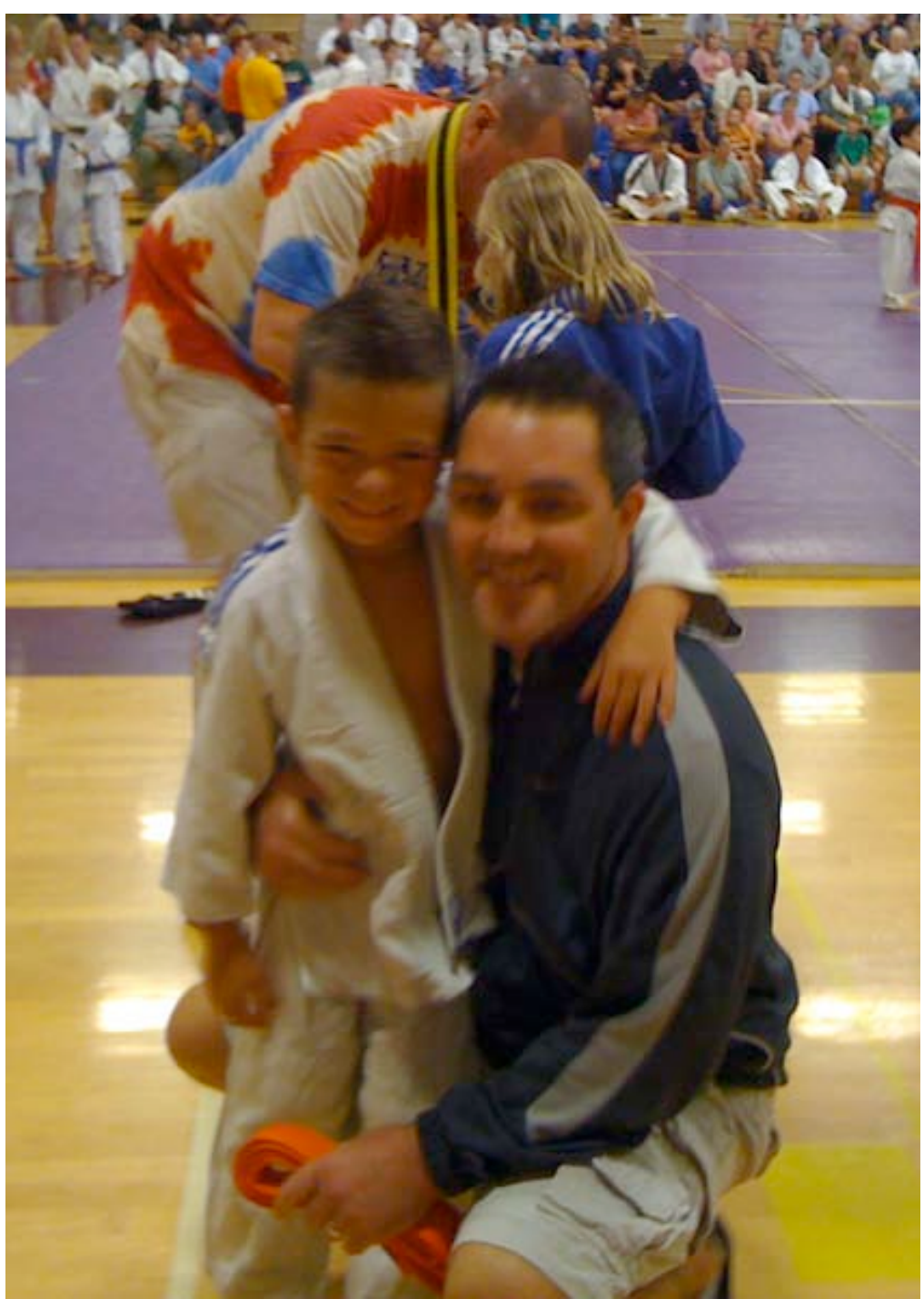
That's some coaching! At the AAU nationals, I asked this little boy to act as if his dad was coaching him. Here is the picture I got. Also, behind him the coach is helping tie his player's belt. There is some grass roots judo for you.