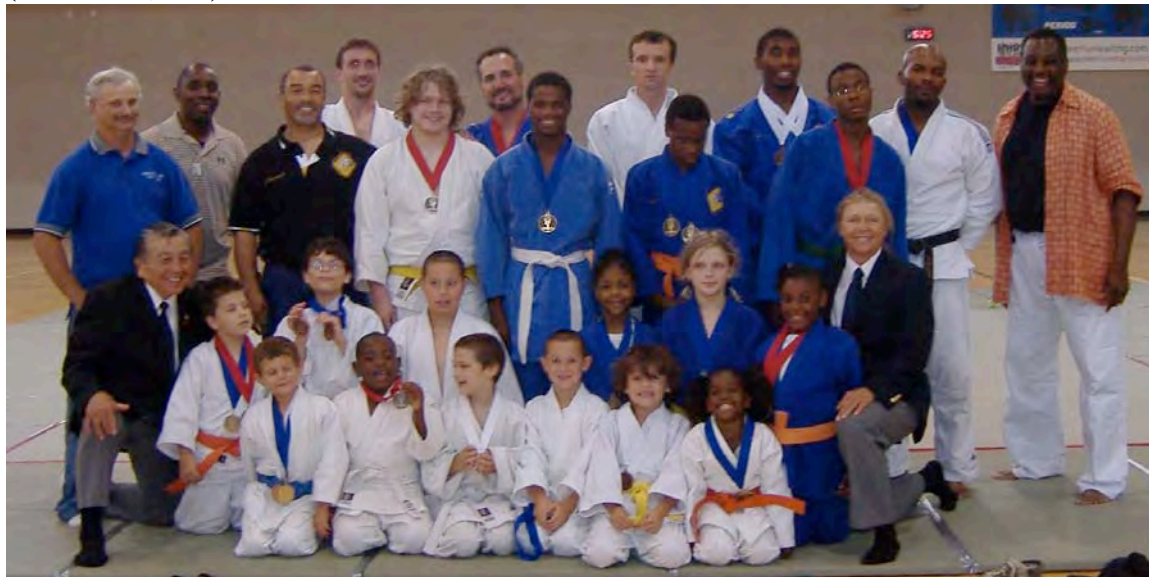
Participants of the State Games of Mississippi / Mississippi Challenge Judo Tournaments