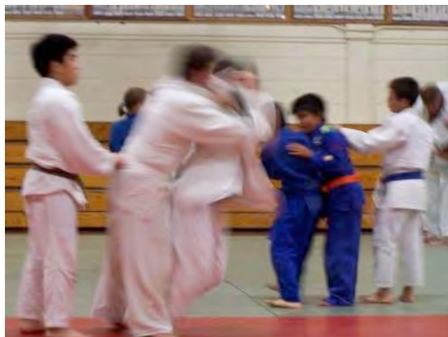
Campers from Gardena, Hayastan, San Shi and Encino judo clubs working together on power uchikomi drills.