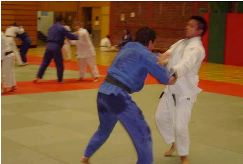
Photo from Wales Rising Stars tour