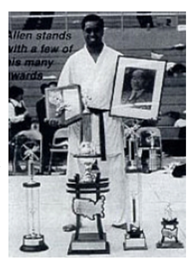
Coage with some judo awards.

and we all hugged and jumped joyously. The "athlete's revolt" which had been brewing for a long time erupted like a volcano.