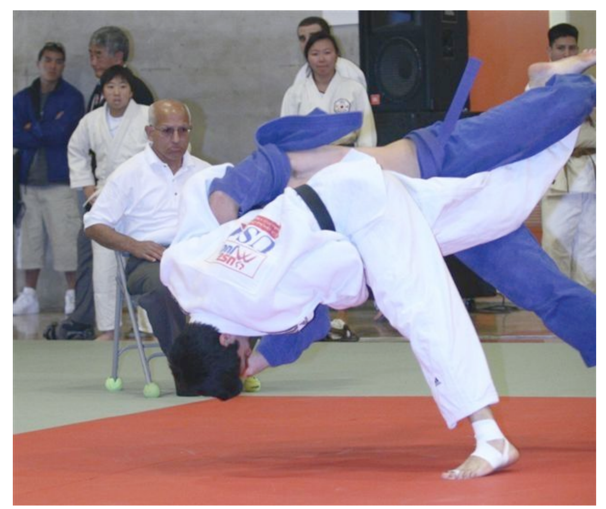
December 2006 USJA NATIONALS SPECIAL ISSUE

Monthly Newsletter of the USJA Development Committee