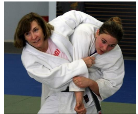
The "Bull and Matador" exercise teaches avoidance & following up with a counter attack.