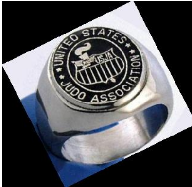
(Ring designed by Tom Crone)